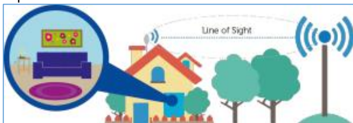
How Airband infrastructure delivers broadband

Connecting Shropshire has signed a contract with a company called Airband, which provides access to superfast broadband over a wireless network transmitting their signal to receivers on people's properties.