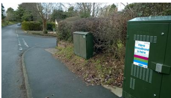
Cabinet 601 in the Claverley exchange area

Once broadband is available in an area, people wanting to access the new network need to make the switch by upgrading to a superfast broadband package with their chosen internet service provider. Residents can visit our website: http://connectingshropshire.co.uk/when-and-where/ to check the availability of faster broadband.