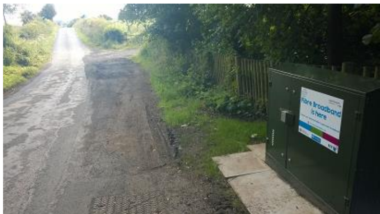
Cabinet 4 in the Quatt exchange area

To date, Connecting Shropshire has provided access to superfast broadband for around 1,200 premises in the ward. That is approximately 800 in and around Alveley and Quatt villages and a further 400 premises in Aston, Claverley, Long Common, Rudge Heath, Upper Aston and Upper Ludstone.